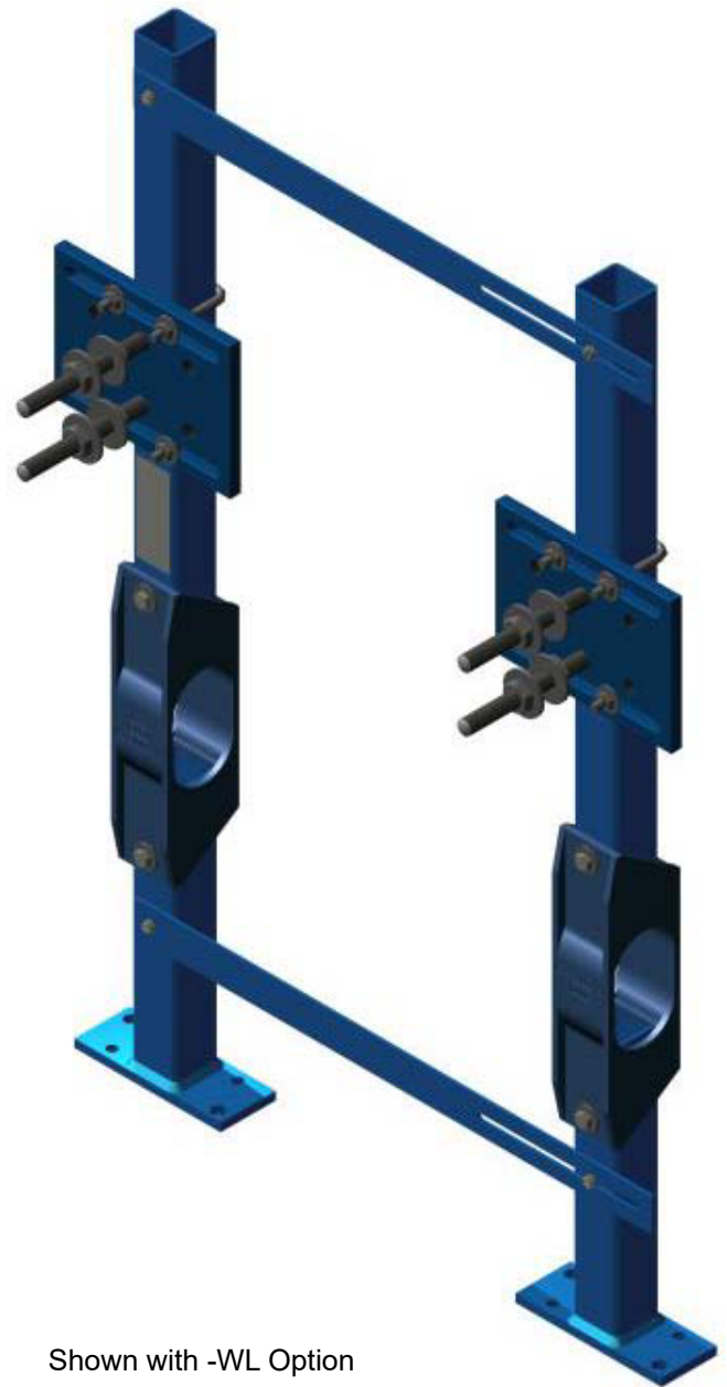
Shown with -WL Option

The information contained in this document is subject to change without notice. Please contact Zurn for most up to date information.