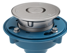
Z415-H Top (NB)

Round only, 6". Vinyl floor clamping ligature resistant drain